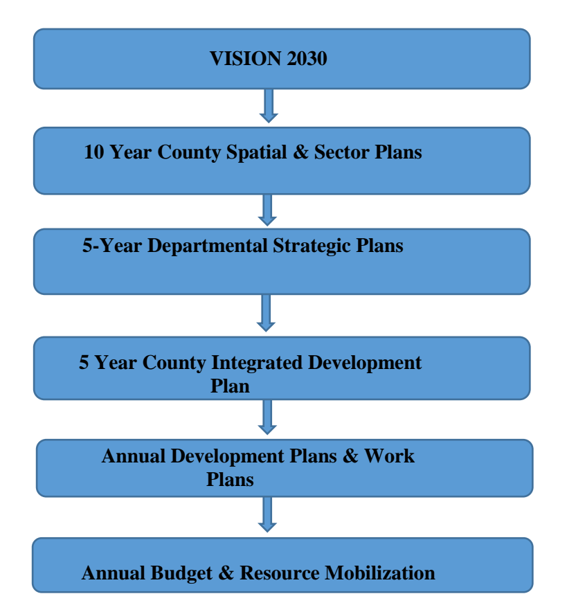
Figure 2: County Planning Framework

According to section 109 of the County Government Act 2012, each county department shall develop a 5-Year Strategic plan with clearly identified strategic priorities. These strategic priorities should be derived from the priorities and development objectives of the CIDP, sectoral plans and spatial plans. The strategic plan of a department should outline the departmental human resource plan and the proposed organizational structure.