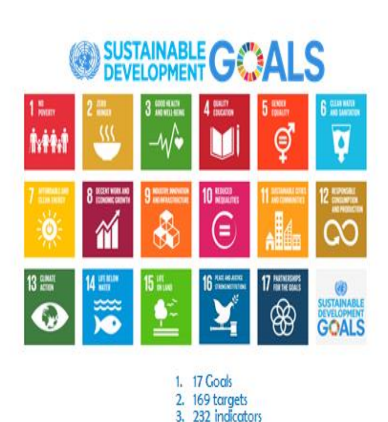
Figure 3: Sustainable Development Goals

The world is implementing the Sustainable Development Goals to be attained by the year 2030. The 17 Goals (SDGs) was established by member countries to advance the development framework beyond 2015.